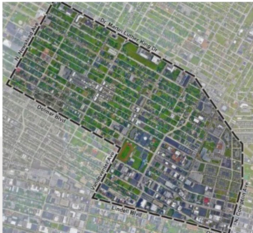
North Central Plan Study Area